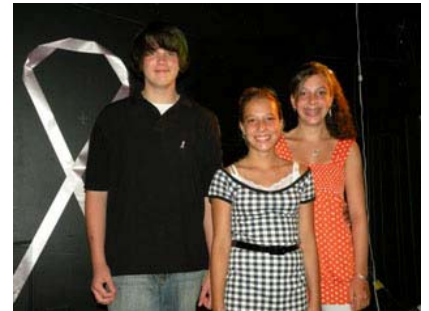
Three kids making their "mark"

Live Entertainment & Buffet Dinner August 7th, 2009 7:00 - 11:00pm Bridgewater Vets Club Banquet Room 85 Cottage St Bridgewater, Ma 02324